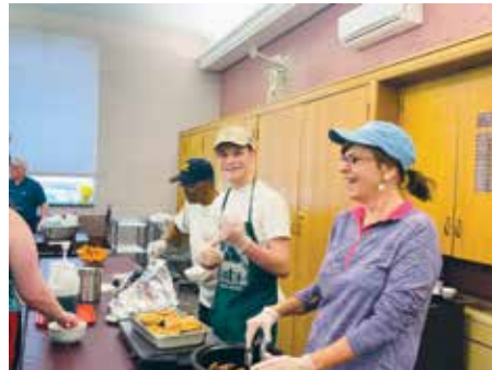
The Breakfast Program has been a joyful ministry of St. Thomas since 2009, and has served thousands of meals.

like socks, gloves, shampoo, soap, toothbrushes, combs and so on. We can keep doing this and I am going to ask St. Mary’s Circle to take the organizing lead in doing this at our church. We will need other people