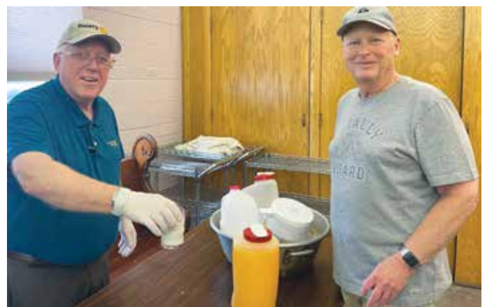
Special thanks to all the volunteers, both from St. Thomas and from other organizations and churches, for their hard work.

Of course, there are plenty of other groups to support in whatever way you choose, like my favorite – Charitable Union, but also the Haven/Inasmuch, United Way, and so on. There are food pantries that need help. But the above two come closest to me to what we have been doing. I hope you will be interested in joining me in any way that you can. There are plenty of volunteer ministry opportunities in our community. We will labor on but in a way that fits our capabilities now.