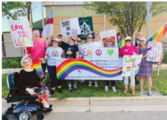
Brightly-clad Episcopalians from St. Thomas and Trinity Church in Marshall showed up for the parade, bringing messages of love.

St. Thomas collaborated with Episcopal parishes in Calhoun County to celebrate Battle Creek PRIDE July 21st-22nd.