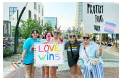
Members of Trinity Church, Marshall and Church of the Resurrection joined us for the festival to staff our booth.